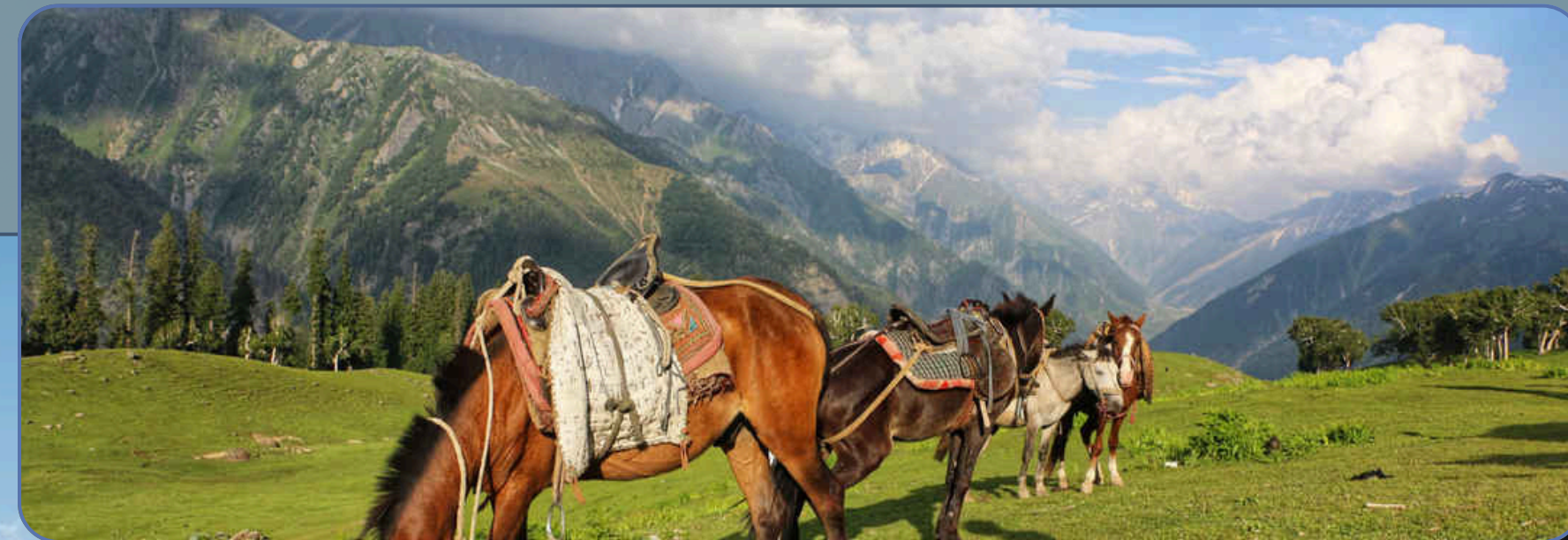
Table Top in Sonamarg is a high altitude flat grassy plateau offering panoramic 360 degree views of the surrounding Himalayan landscape. Known for its serene atmosphere, it serves as a quiet alternative to the busier spots in Sonamarg town, making it a popular spot for picnics, photography and short treks.